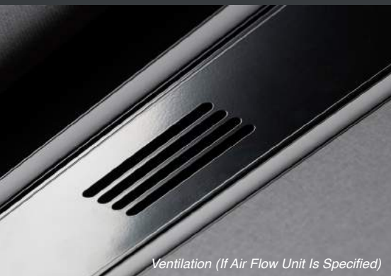
Ventilation (If Air Flow Unit Is Specified)