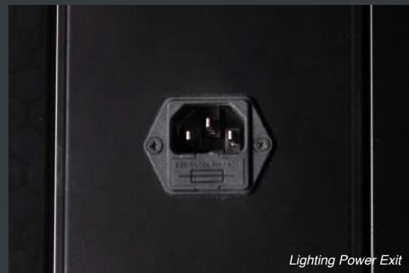
Lighting Power Exit