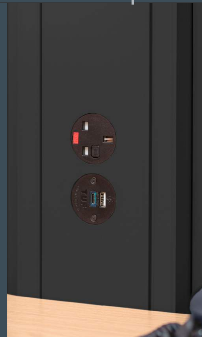
Encompass Power and Data