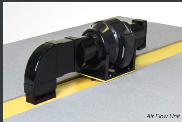
Air Flow Unit