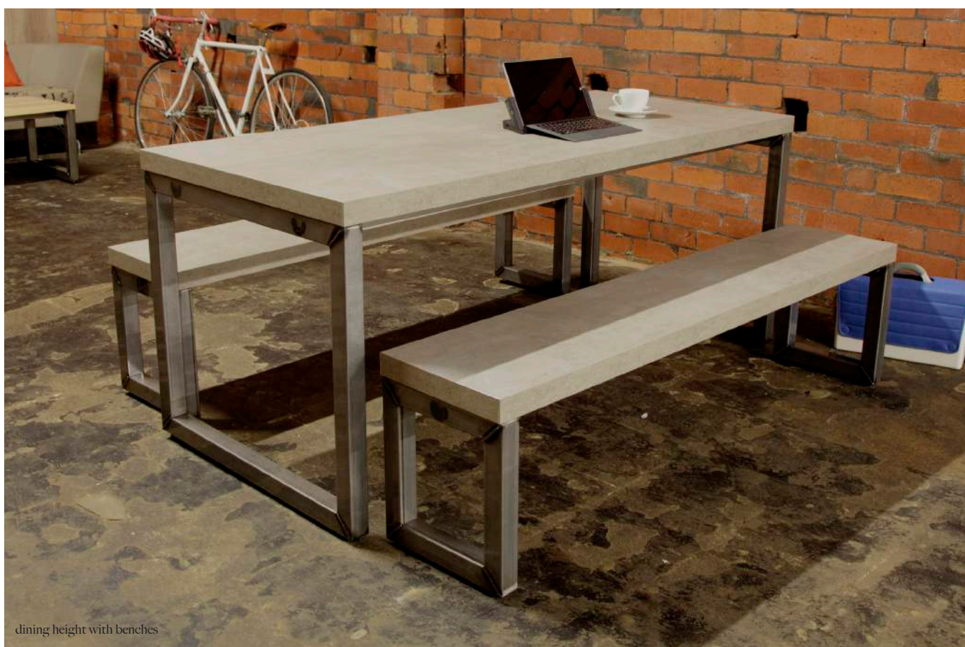
dining height with benches