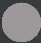
SILVER JOS RAL9006