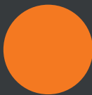
DEEP ORANGE ORS RAL2011