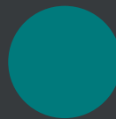
WATER BLUE WBS RAL5021