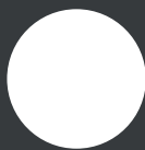
WHITE JWS RAL9016

PLEASE NOTE IF ANY OTHER COLOUR IS SPECIFIED, ALL LIFTING COLUMNS WILL BE SILVER RAL9006