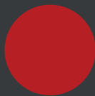
ARROW RED ARG RAL3001