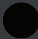
BLACK BLS RAL9011