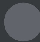
GRAPHITE GREY GGS RAL7024