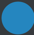
REGAL BLUE RBS RAL5012