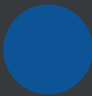
SIGNAL BLUE SBS RAL5005