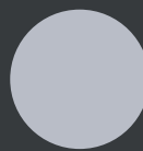
PALE GREY PGS RAL7035