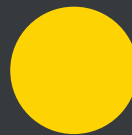
ZINC YELLOW ZYS RAL1018