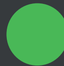
FERN GREEN FGB RAL6018