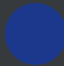
ULTRAMARINE BLUE UBS RAL5002