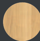
ROMANO CHERRY RCM