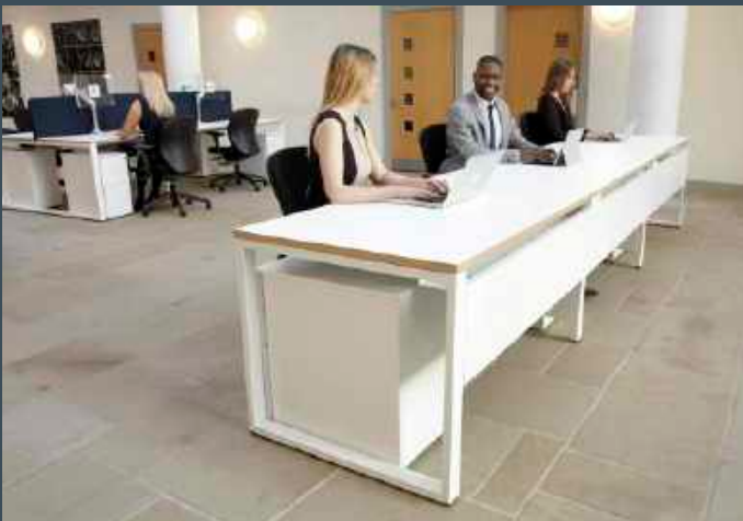
Side-to-side 3 Person Desk Configuration