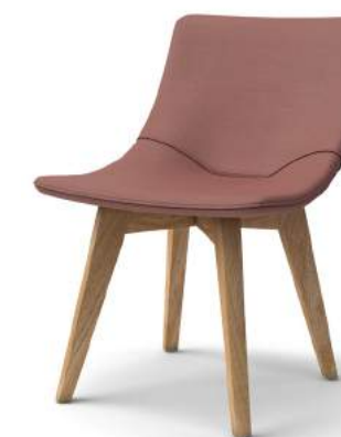
4 leg wooden frame