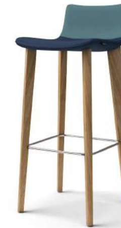
Miss wooden base stool, two tone 1 fabric (back/seat)