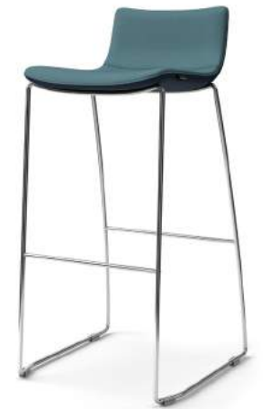
Miss metal base stool, two tone 2 fabric (inside/outside)