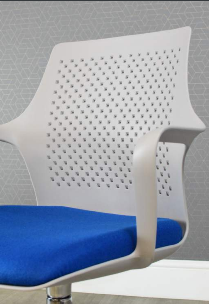
Flexi-Work light grey back

With an extensive range of fabric bands, bases and a choice of 5 chair colours, the Flexi-Work is truly versatile designed to suit any office interior design scheme.