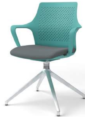
raised polished frame