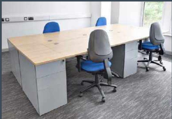
Single rectangular solo desks with desk high pedestals

Ideal for fast-paced offices with constantly changing team structures, Solo desks are quick and easy to relocate and assemble.