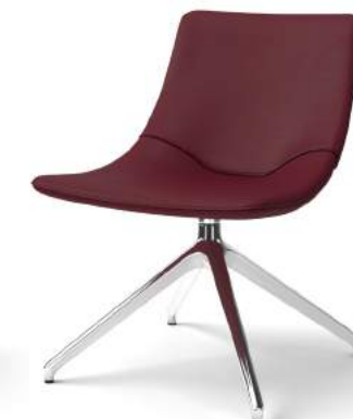
raised polished base