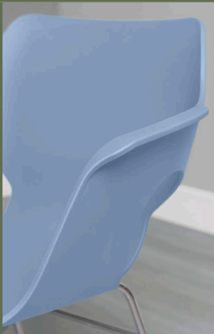
Olé's distinctive curved shell