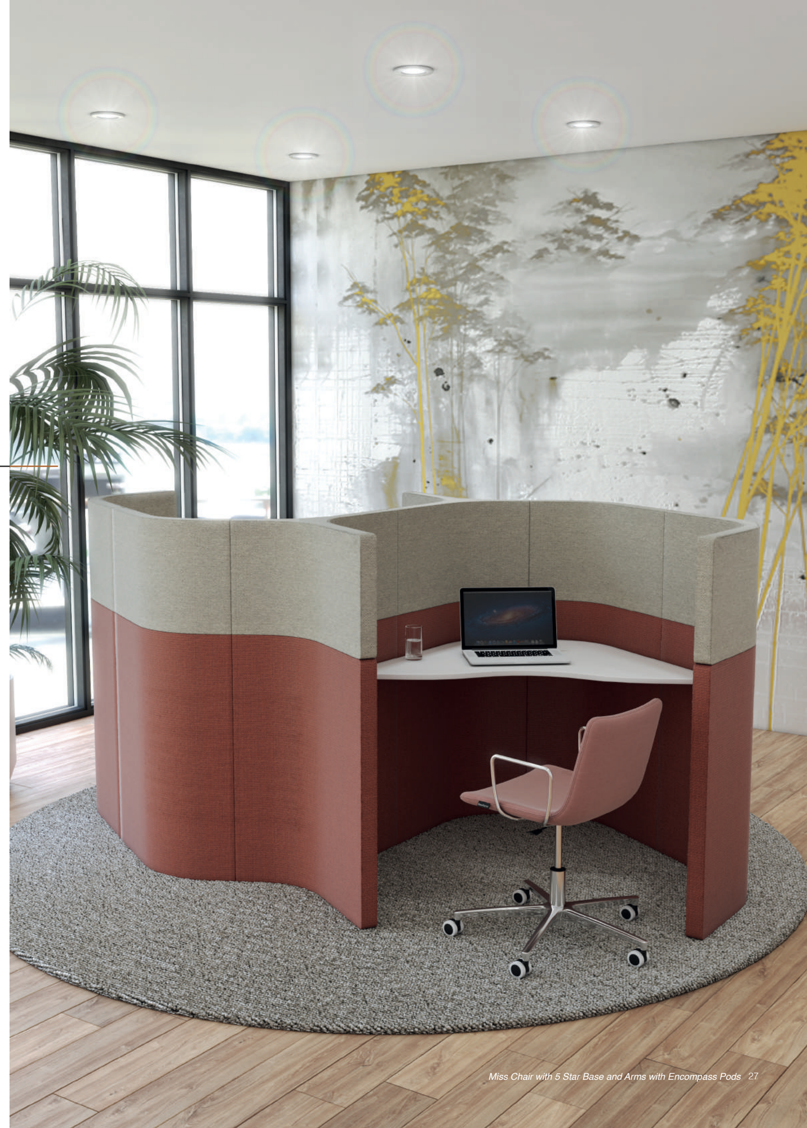
Miss Chair with 5 Star Base and Arms with Encompass Pods 27