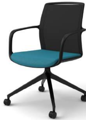
raised base with castors