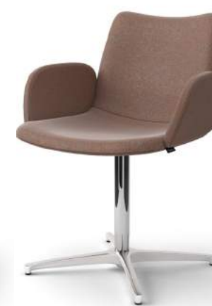
4 star base