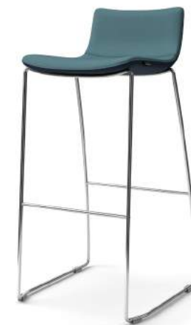
Miss metal base stool, two tone 2 fabric (inside/outside)