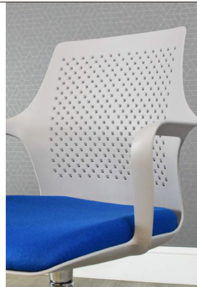
Flexi-Work light grey back