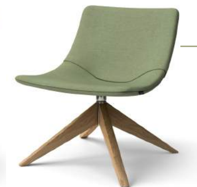
raised wood base