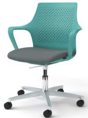
5 star frame