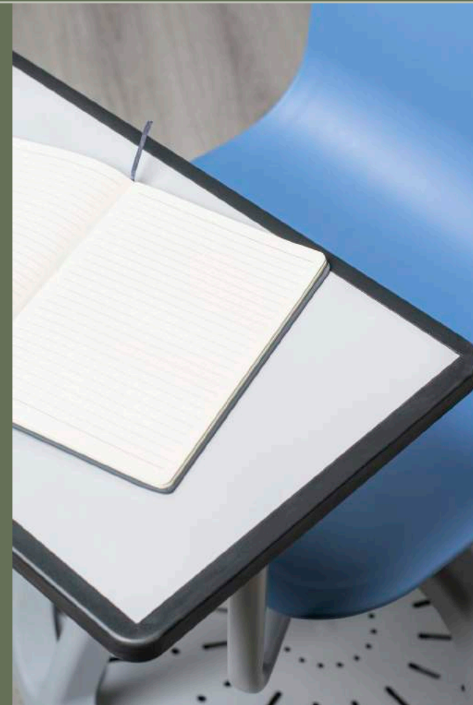
College chair 360° orbital writing tablet