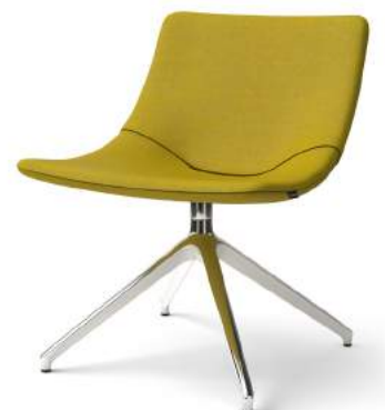
raised polished base