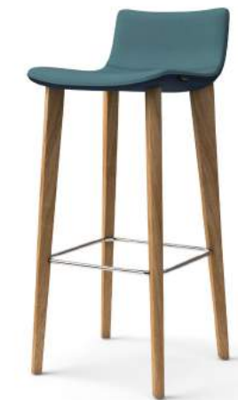
Miss wooden base stool, two tone 2 fabric (inside/outside)