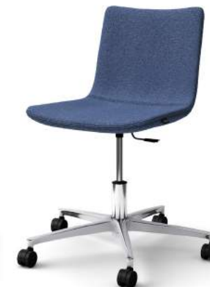
5 star base with optional tilt mechanism