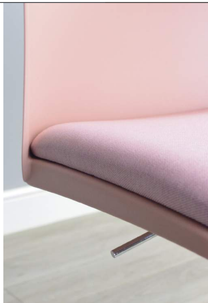
Tonez 5 Star Chair with Peach Pink Back