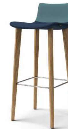
Miss wooden base stool, two tone 1 fabric (back/seat)