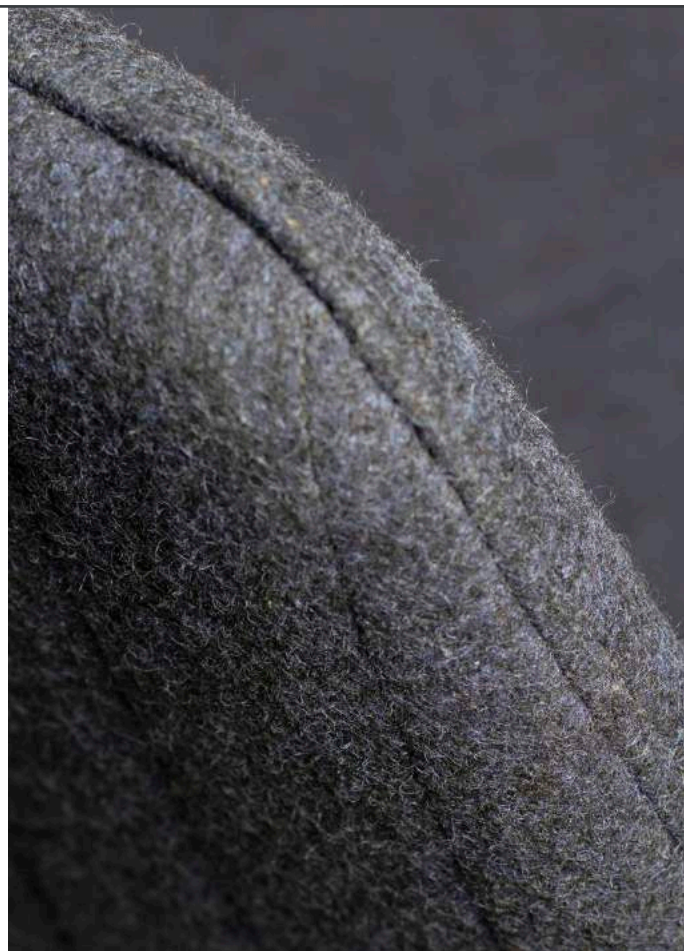
Valido Chair with Bespoke Camira Synergy Quilt Fabric

The 5 base options on Valido make this chair range truly versatile, lending itself to relaxed meeting areas and collaboration zones. The matching large lounge chair allows Valido to bring continuity throughout the building.