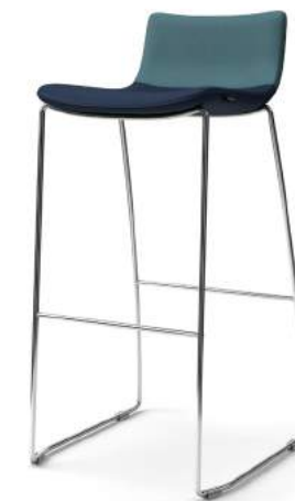
Miss metal base stool, two tone 1 fabric (back/seat)