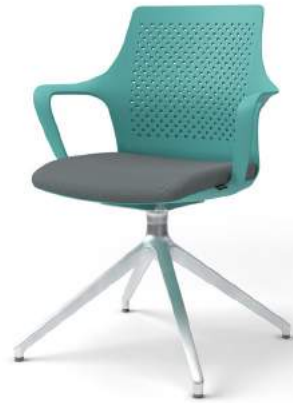
raised polished frame