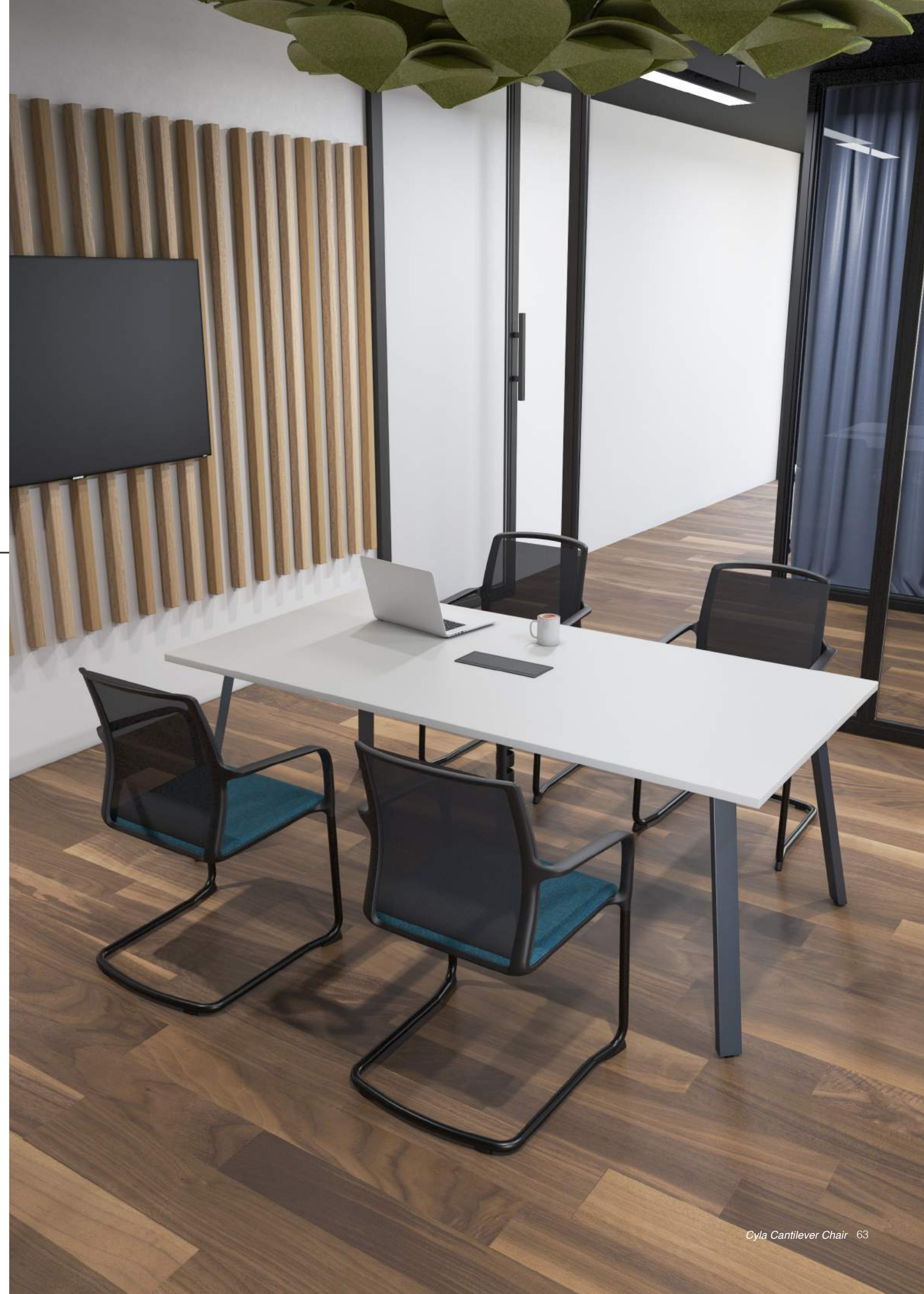
Cyla Cantilever Chair 63