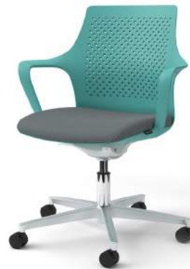
5 star frame with tilt mechanism