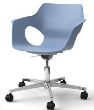
5 star base