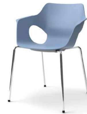
4 leg frame