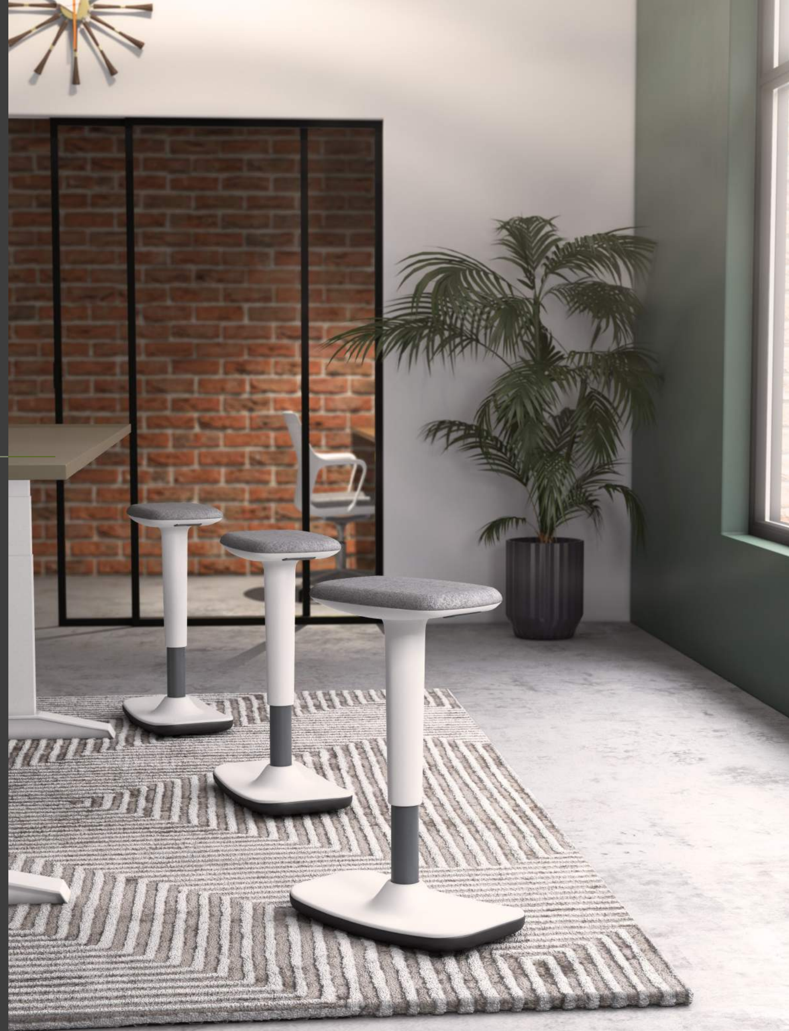
Jot-Up Meet Table & Jot-Up Stool