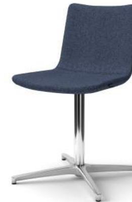
4 star base