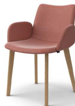
wood 4 leg