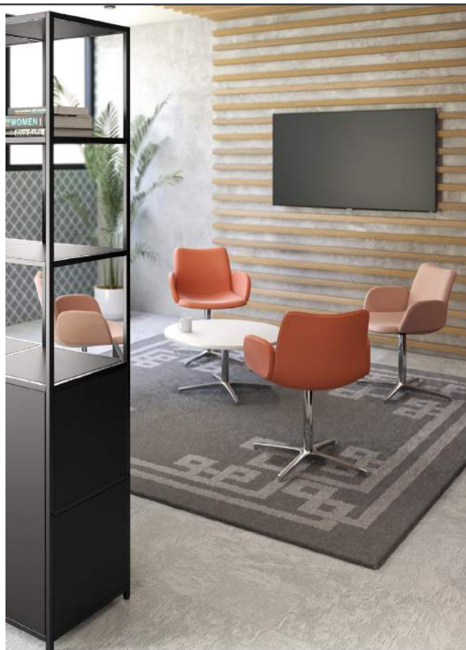
Miss Collaborative Chair with 4 Star Base & Arms