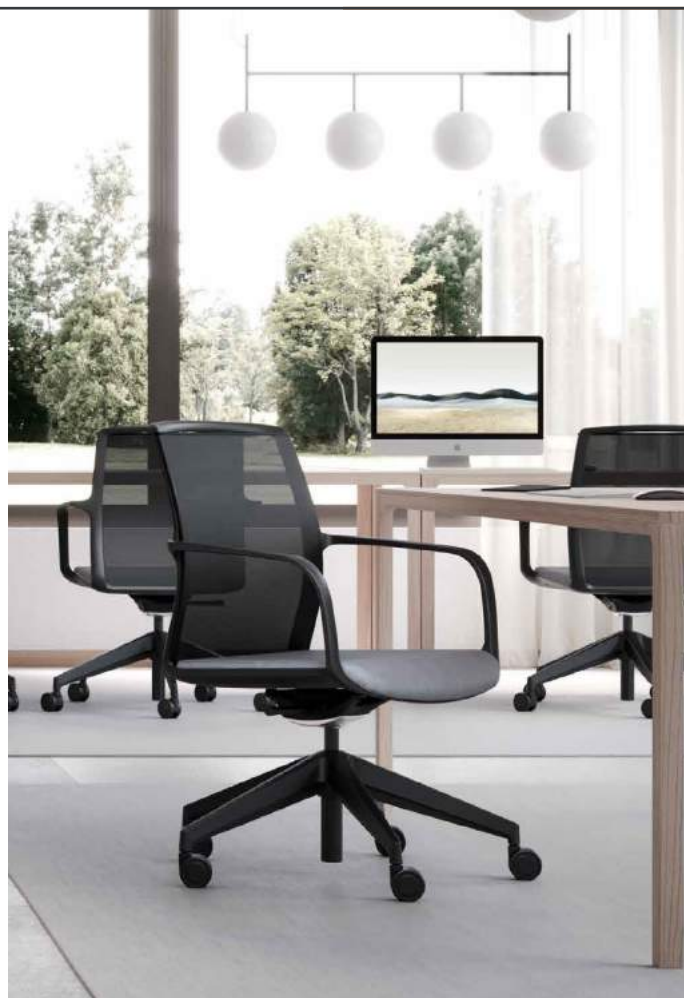
Cyla 5 star chair with black painted base, frame & arms