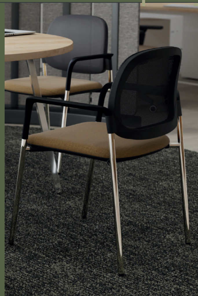
Equity Visitor with upholstered back