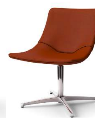
4 star base