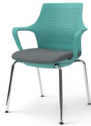
4 leg frame

Designed for collaboration areas or solo workspaces where users spend a significant period of time, the Flexi-Work chair with 5 star base is also available with a 12-degree tilt mechanism to boost movement and relieve the pressure building up in the back, making the user more comfortable, and ultimately more productive.