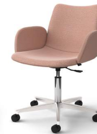
5 star base with optional tilt mechanism