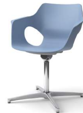
4 star base