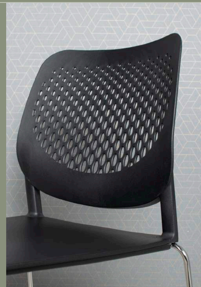
One-Shot Perforated Back in Black. Please Note, Only Skid Base Chairs Stack on a Trolley.

One-Shot is a contemporary plastic stacking chair for use in conferences, seminar rooms, training rooms, informal meeting areas, cafés and canteens. This stacking chair range is available with a 4 leg or skid rod frame, finished in chrome with optional matching plastic arms.