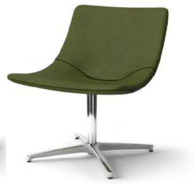
4 star base