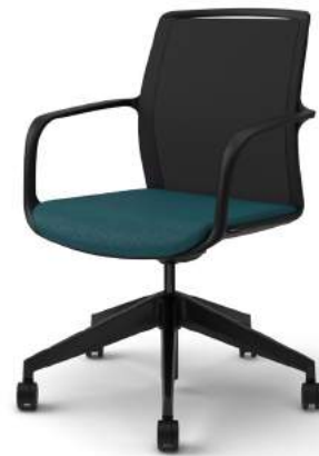
5 star base