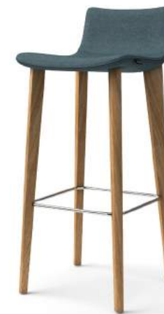
Miss wooden base stool, single fabric