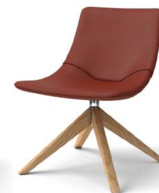
raised wood base