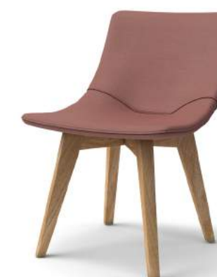
4 leg wooden frame