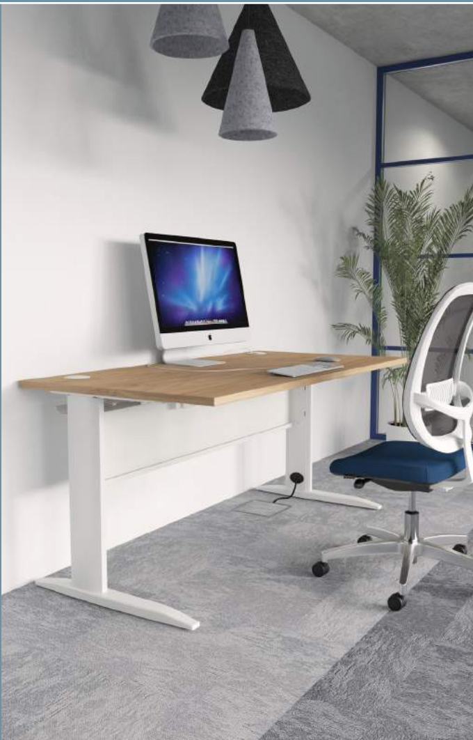
Single Todd Desk