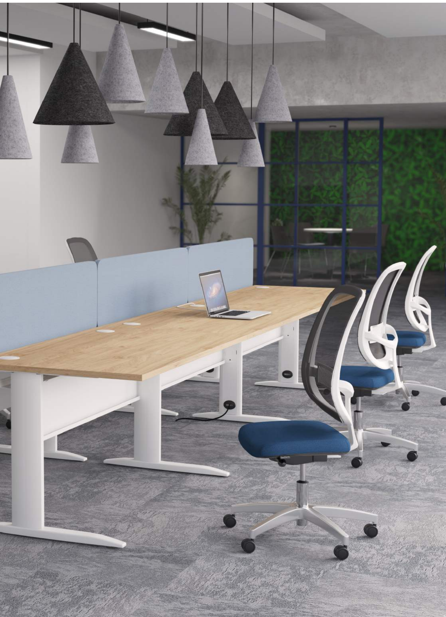
Todd Starter, Extension & End Desk Configured Back-To-Back with a Central Screen