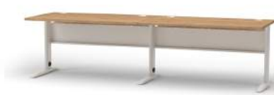
Side-to-Side Modular Desk