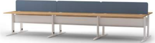
Side-to-Side Modular Desk x2 Placed into a back-to-back desk configuration