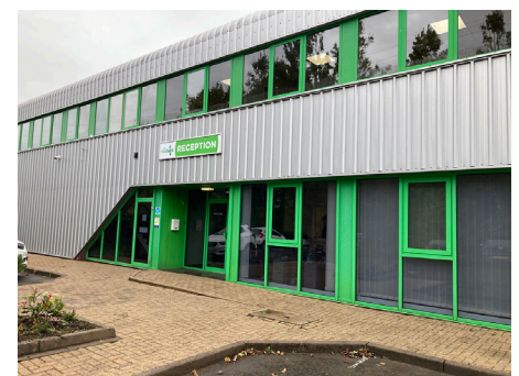
Scottish Foodbank with donated furniture