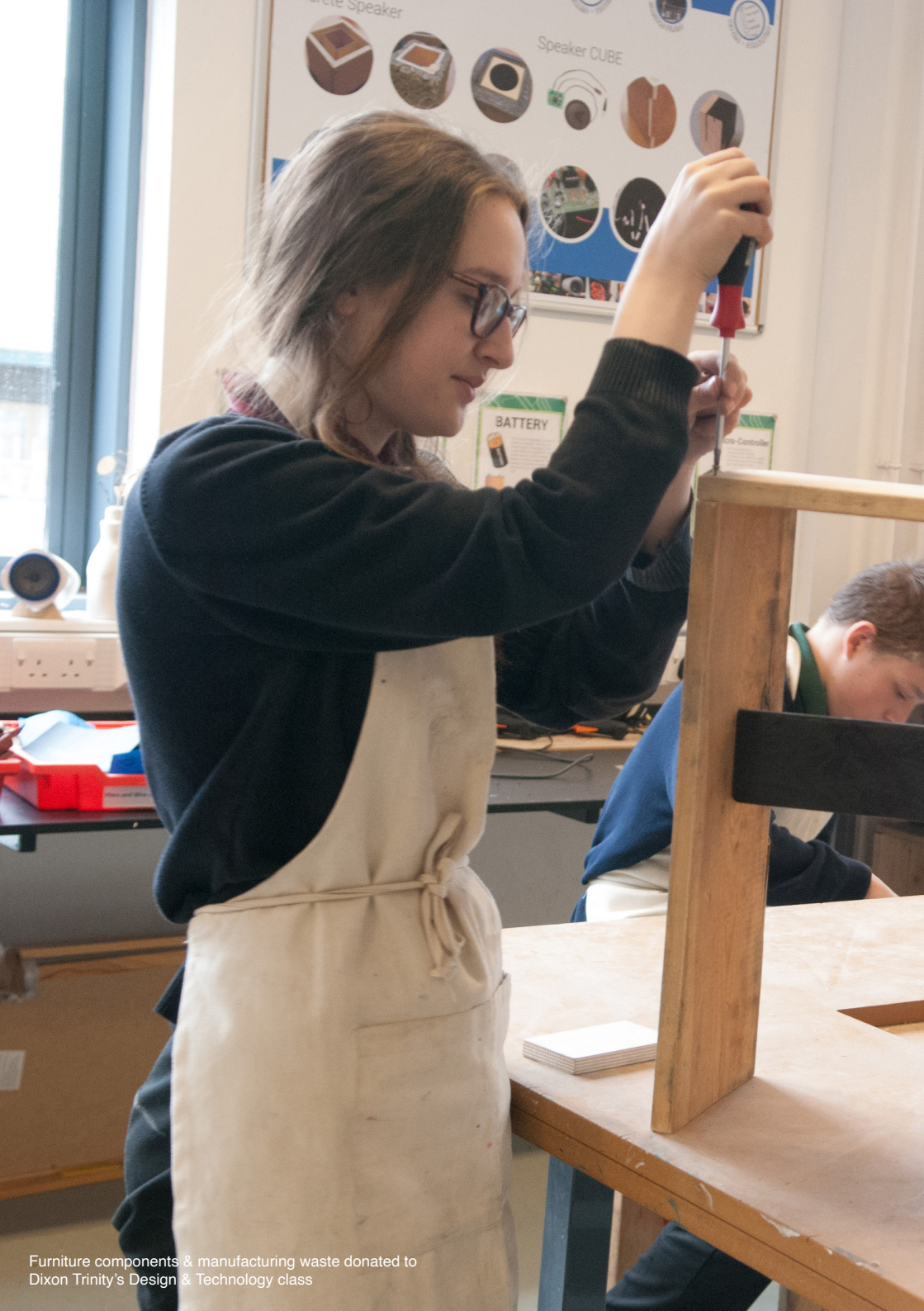
Furniture components & manufacturing waste donated to Dixon Trinity's Design & Technology class