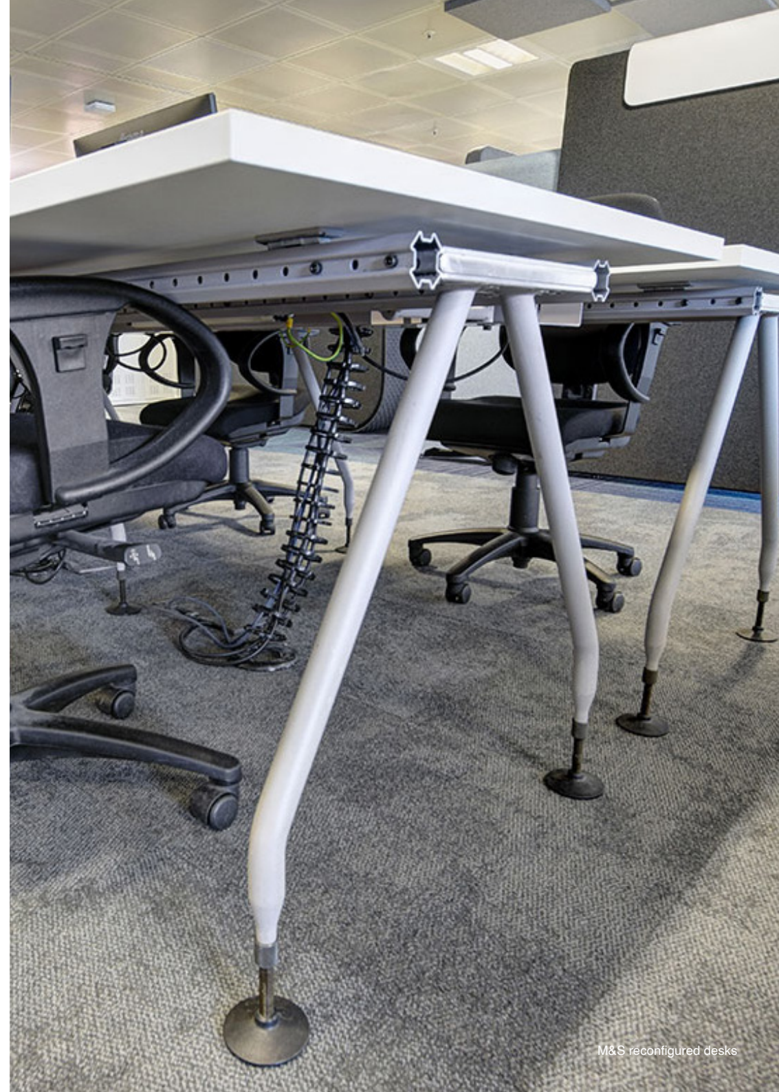
M&S reconfigured desks

To implement their new office design, 800 existing workstations would be rendered obsolete. Although the workstations were purchased over 15 years ago, they were still in good condition and of a very high quality, however unsuitable for the project as smaller desks were required to maximise occupancy on the floor plates. Flexiform dismantled, remanufactured the steel underframe into new desks, recycled the old worktops, replacing them with new. 700 workstations were re-used rather than being disposed of, this prevented tonnes of steel and aluminium being sent for recycling and reduced purchasing costs of new furniture saving 47.6 tonnes of carbon.